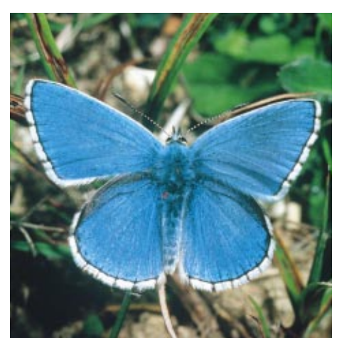
Adonis blue butterfly. 20,623

Species depend upon one another for survival. The very existence of humans on Earth is supported by this 'web of life'. For example, plants need insects for pollination; plants and algae provide the oxygen animals need; and animals eat