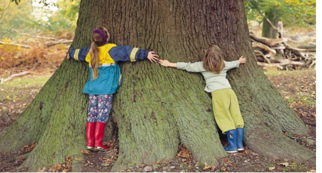
Knole Park SSSI, Kent. 'Tree hugging' old oak. Peter Wakley/English Nature 20,204