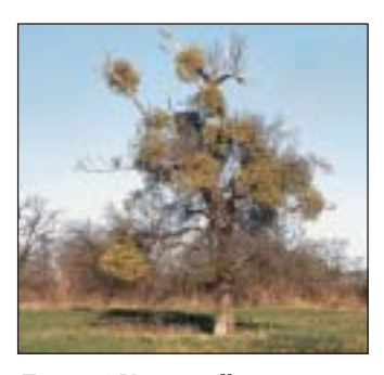
Figure 5. Viscum album growing on its favourite host, cultivated apple.

persers are almost exclusively birds. The few exceptions include Dromiciops australis, an Argentinean tree-climbing marsupial that spreads the seed of Tristerix corymbosus. Whichever vector species, dispersal and 'planting' are always achieved by glueing the sticky berries to potential host trees, either through wiping the sticky seed from beaks or by defecating partially digested fruit.