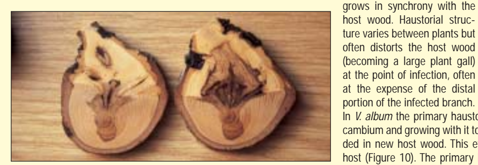
Figure 10. Haustorial cross-sections: TS of the host (and LS of the mistletoe), showing distorted host wood and fused cambial tissue.

Vascular links can take several months to establish, and aerial growth is negligible in the first year. During this time, an invasive organ known as a haustorium develops under the bark. This fuses with and