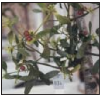
Figure 4. The Spanish Viscum cruciatum showing its red berries.

These figures varied regionally: garden records were >60% in the east, south-east, north and extreme west; orchard records were highest in