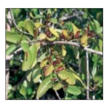
Figure 2. Tapinanthus sansibarensis, an African member of the Loranthaceae, showing colourful flowers, characteristic of the family.

The first national mistletoe survey in the early 1970s (Perring, 1973) mapped the species on a two by two km square (tetrad) basis and assessed host frequency. The results suggested that mistletoe distribution is influenced indirectly by man, as most records were of plants on non-native or planted trees. Cultivated apple was confirmed as the most frequent host, followed by hybrid limes ( Tilia spp ), hawthorn ( Crateagus spp ), hybrid poplars ( Populus spp ) and false acacia ( Robinia pseudacacia ; Figure 6). Mistletoe seems to prefer its hosts in an open situation rather than woodland, and so orchards, parkland and gardens are ideal, if somewhat artificial, habitats. Its distribution (Figure 7) was concentrated in Herefordshire, Gloucestershire, Worcestershire and Somerset, with scattered records elsewhere in the