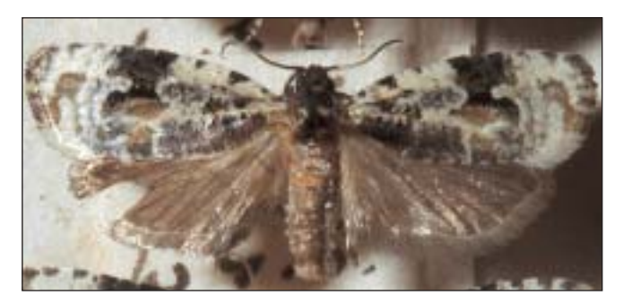
Figure 8. Mistletoe tortrix moth, Celyhpa woodian. From Bristol City museum collection.

The British midland custom of hanging mistletoe all year and ceremonially replacing it each Christmas, whilst burning the original, has now been lost. The kissing tradition, once largely confined to Britain, is now established in all English-speaking countries, even if they do have to make do with 'incorrect' local mistletoe species. Seasonal trade, to