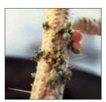
Figure 3. The African Viscum minimum on Euphorbia.

1970s analysis and assess whether British mistletoe was declining with the decline in traditional apple orchards. The survey, a public participation project, was organised by the Botanical Society of the British Isles (BSBI) and Plantlife. More than 12 000 winter sightings were sent in between 1994 and 1998. Results broadly confirmed the distribution patterns