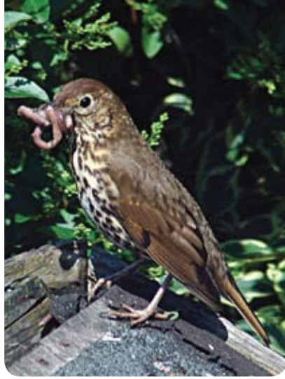
Left: song thrush