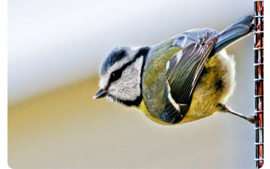
Top: blue tit Above: comma

There is also an increasing demand and desire for locally grown food. London's gardens could contribute to meeting this demand (as they have done in the past) but only if the quantity and quality of the resource, particularly a healthy garden soil, is maintained.