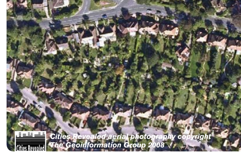
Cities Revealed aerial photography copyright The Geoinformation Group 2008