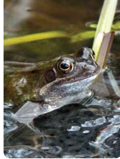
Right: common frog