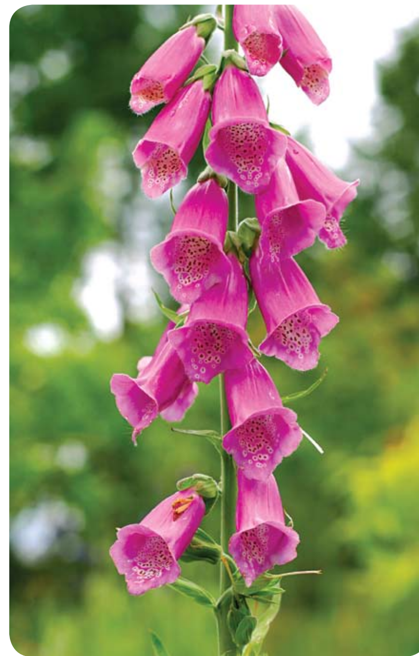
Above: foxglove © Metalanguage Design