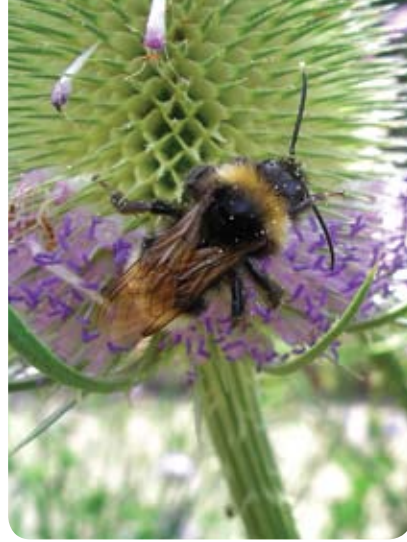
Centre: bumblebee on teasel © Metalanguage Design