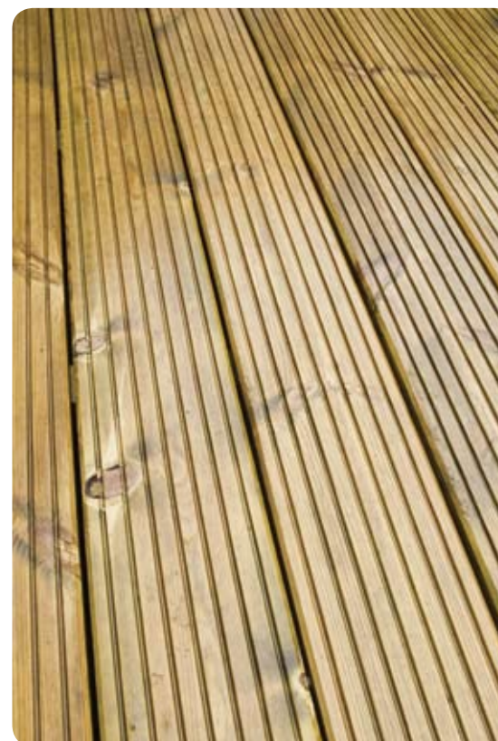
Top: a highly designed garden Left: decking Right: front gardens lost to parking

An area of vegetated garden land equivalent to 21 times the size of Hyde Park was lost between 1998-99 and 2006-08, representing 3,000ha or a 12% reduction. This constitutes an annual loss of an area two and a half times the size of Hyde Park.