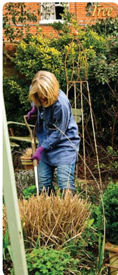
Above: gardening

For further information on wildlife gardening across the UK go to The Wildlife Trusts and the RHS' gardening website www.wildaboutgardens.org.uk